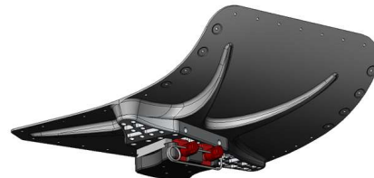
Figure 2 – AFM-505-3 Utility Mount, LH Downpost Configuration

The AFM-505-3 Downpost Utility Mount consists of a billet machined aluminum assembly that attaches to the bottom skin of the helicopter and provides means to attach a small Camera or Sensor to the bottom left side.