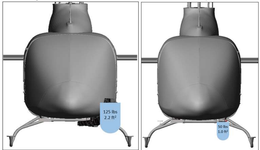
Figure 4 - Image Showing Max Payload for Each Configuration (-1 Beam Mount Left, -3 Downpost Mount Right)

Payloads with concave frontal surfaces are prohibited.