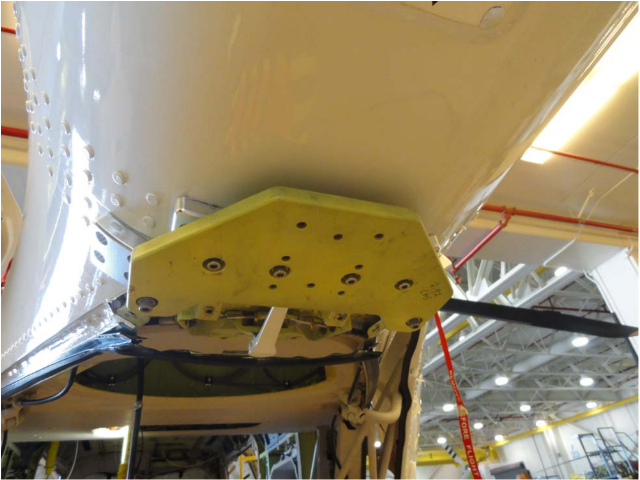
FIGURE 3.1 AFM-AM429-1 Aft Utility Mount